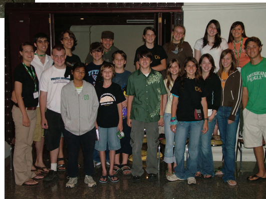
MKs at Asia Pacific Retreat in Chiang Mai, Thailand.